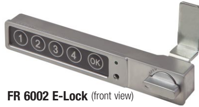
FR 6002 E-Lock (front view)