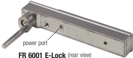
FR 6001 E-Lock (rear view)