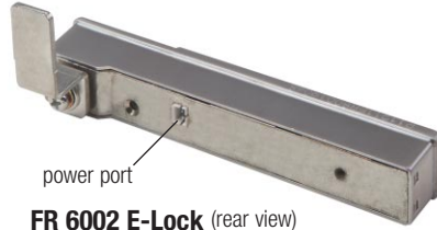
FR 6002 E-Lock (rear view)