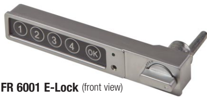
FR 6001 E-Lock (front view)

PRODUCT TYPE: Electronic Locking Systems