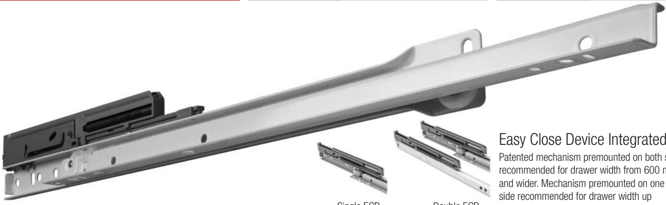
Single ECD Double ECD